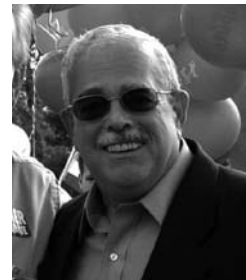
Chairman Gerry Connolly